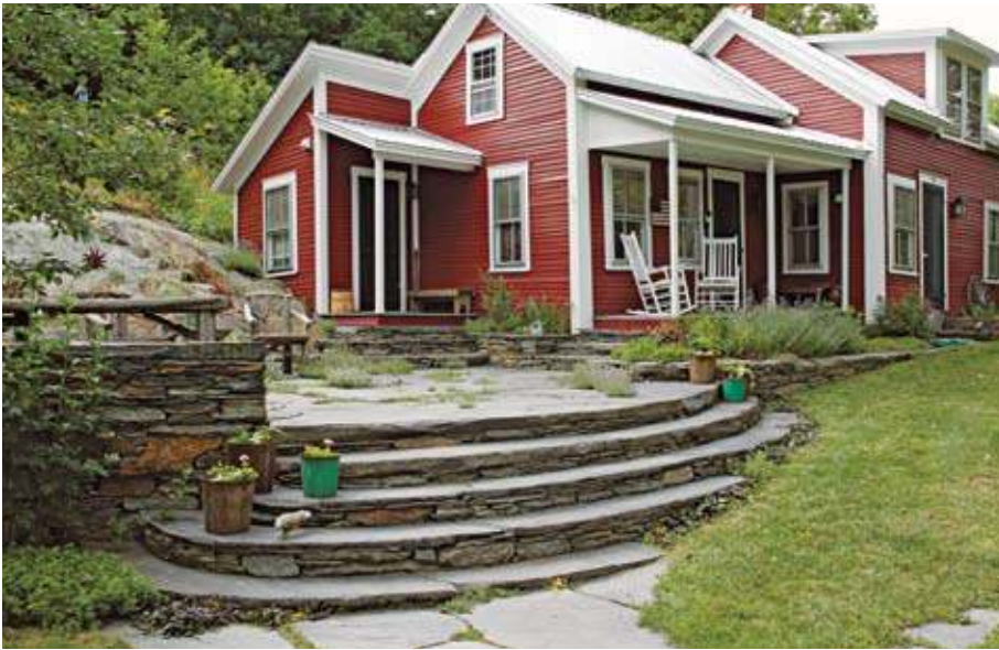
Local stonemason Ted LaRock designed and built a raised patio of Vermont schist with wide rounded stairs, a connecting walkway to the guesthouse, and retaining walls for various flowerbeds.